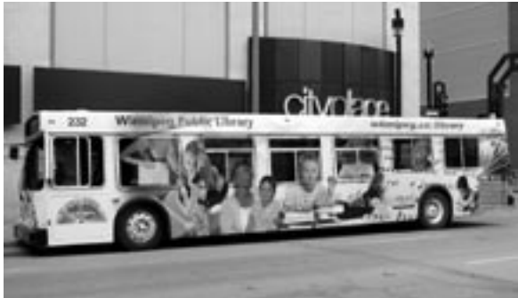
A new Winnipeg Transit bus in 2005 promotes Winnipeg Public Library services.