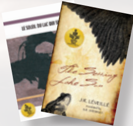
The Setting Lake Sun / Le soleil du lac qui se couche by J.R. Lévêillé