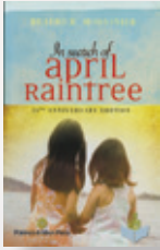
In Search of April Raintree by Beatrice Mosionier