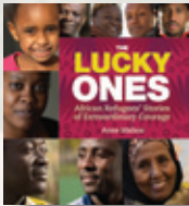
The Lucky Ones: African Refugees' Stories of Extraordinary Courage by Anne Mahon