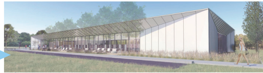
Winnipeg TRANSCONA LIBRARY Cibinel Architecture