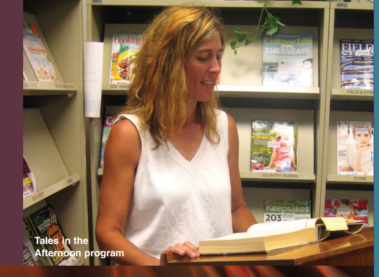
2012 Winnipeg Public Library Annual Report

*In 2012, two libraries were closed for renovations for a total of 8 weeks of closure.