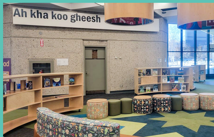
Ah kha koo gheesh renovation completed in 2022 as part of the Millennium Library renovations that started in August.

*includes expenditures from book sales, trust accounts and grants