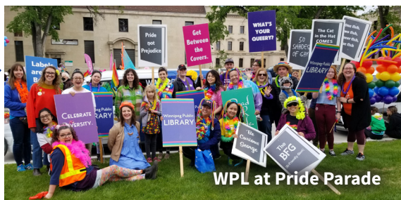
WPL at Pride Parade