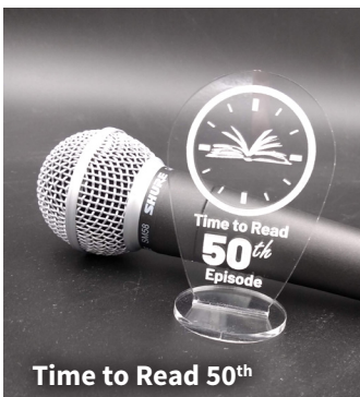
Time to Read 50 th

The Library wishes to thank the following people and organizations for their generous contributions in 2022: