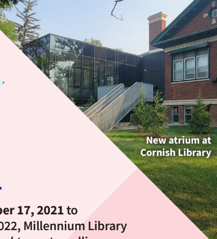
New atrium at Cornish Library