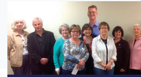
The Board of the Friends of the Library