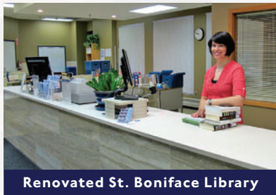
Renovated St. Boniface Library

"Thank you for giving me an opportunity to learn and grow in this most special, unique way." – Human Library reader