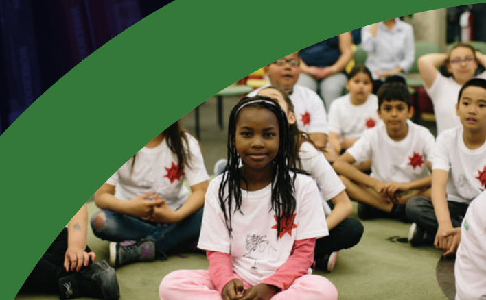
National Launch of 2013 TD Summer Reading Program

The year 2013 has been a time of facility improvements, community development and continuing growth in our service delivery philosophy. The momentum of 2013 will carry into 2014 with the development of a new 5-Year Strategic Plan to set the future direction of our library system.