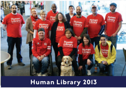
Human Library 2013

"This is a great way to introduce children to books and songs and to introduce them to other children in a fun and inexpensive way. It's WONDERFUL!!" – Time for Twos participant