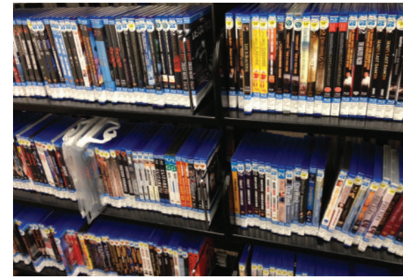
Our movies were borrowed 491,684 times in 2011.

Change is a constant at Winnipeg Public Library and as technology plays an increasingly important role in our lives, the library is using technology to deliver its collections and services in new and innovative ways. In 2011, eBook usage increased over 200% as the library circulated 119,000 eBooks.