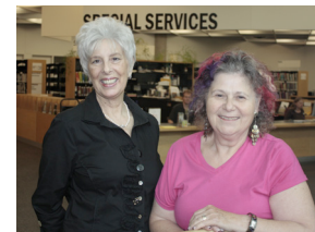
Winnipeg Library Foundation

The Winnipeg Library Foundation continued its work of fundraising to support the Library in 2010. In addition to seeking the ongoing support of donors to fill the shelves of the Millennium Library, the Foundation has also embarked on a campaign for Millennium Library Park. The plans for the space are exceptional and the support received so far has been very positive. More information is available on the Foundation's website at www.winnipeglibraryfoundation.ca ; anyone interested in volunteering or donating is encouraged to contact the Foundation.