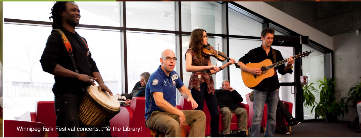
Winnipeg Folk Festival concerts... @ the Library!

"I am a regular user of the Sir William Stephenson Library. Please let them know how much I appreciate their range of knowledge on books. When I can't remember the title of the book, I just have to mention the story line and they know what I am talking about. They are always very helpful when I need assistance and always pleasant to talk to."