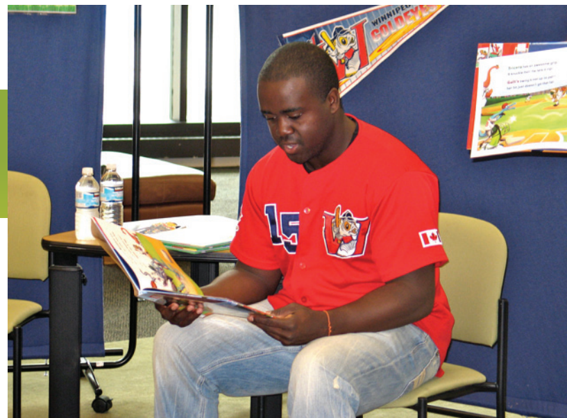
Winnipeg Goldeyes Reading at Summer Reading Program Wind-Up