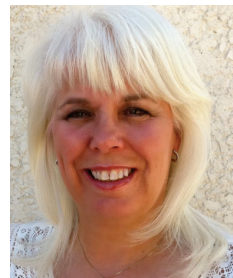
Winnipeg Public Library Board