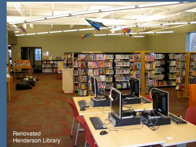
Renovated Henderson Library