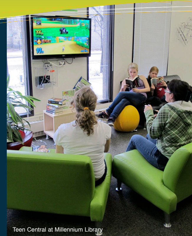
Teen Central at Millennium Library