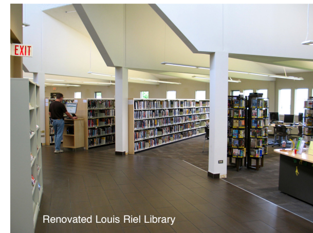
Renovated Louis Riel Library

Winnipeg Public Library 251 Donald Street Winnipeg, Manitoba R3C 3P5 winnipeg.ca/library email: wpl-info@winnipeg.ca