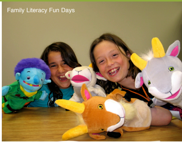
Family Literacy Fun Days