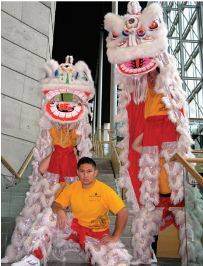
The Wushu Manitoba Dragon & Lion Dance Team performed at a Skywalk Concert.